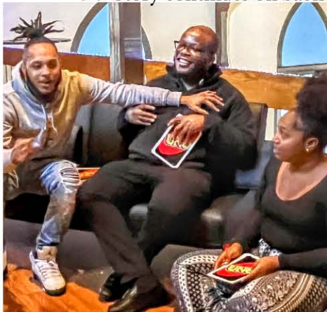
The pastor enjoying a game of Uno with the youth of the parish at the Dumb Ox