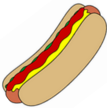
Photo Booth International Cafe