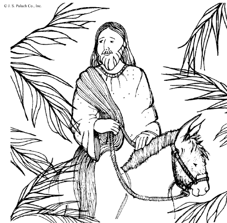
Blessed is he who comes in the name of the Lord.

ADORATION OF THE BLESSED SACRAMENT: is offered each Wednesday at 7:00 p.m. in the Church. All are welcome!